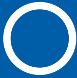
Tube Slide TURBO Ø 800